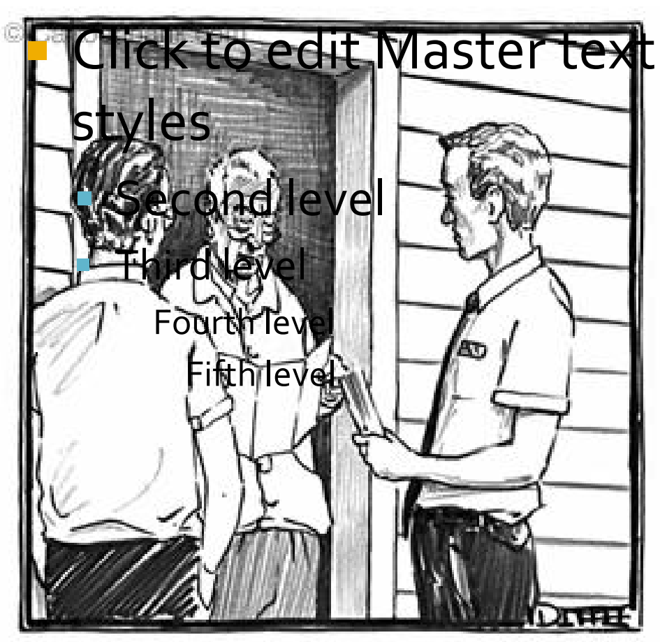
"You call this literature?"